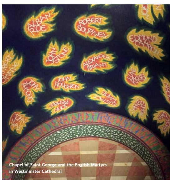
Chapel of Saint George and the English Martyrs in Westminster Cathedral

Our aim is to recognise and reward young people working in these crafts, together with their teachers, for their most amazing achievements, their creativity and their ingenuity. They represent the future, and our commitment to support them is total.