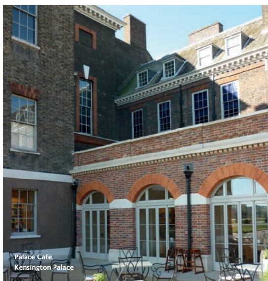
Palace Cafe. Kensington Palace